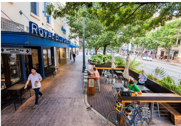
City of Austin, TX